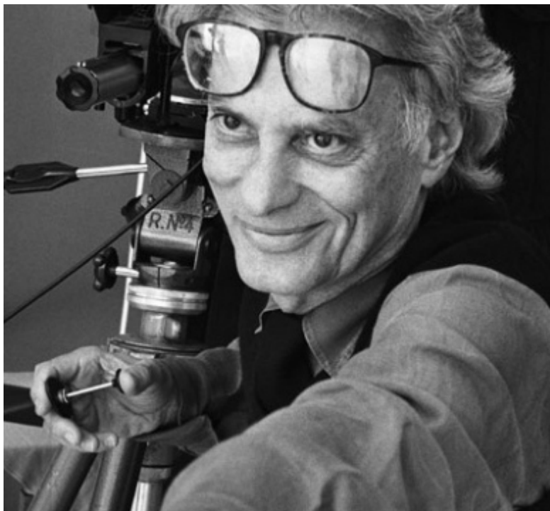
the man himself, in action